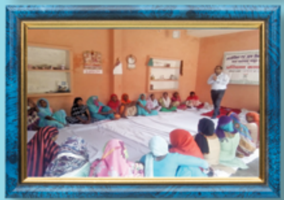
ANIMAL HEALTHCARE PROGRAM